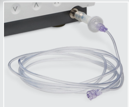
Disposable Vacuum Line and Filter