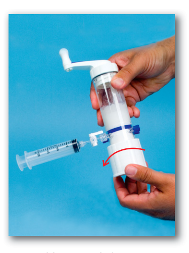
Lower blue o-ring below open port by rotating mixer base