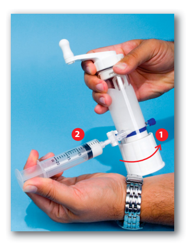
Rotate base of mixer to close the port by raising the o-ring