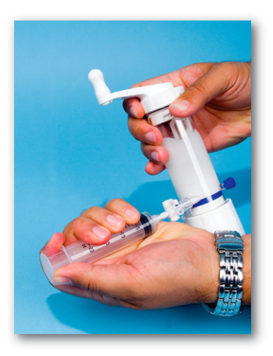
• Withdraw 10 cc of mixed cement into 20 cc syringe