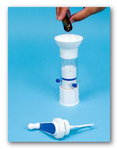
· Add liquid monomer