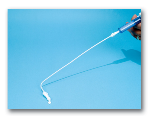
After expelling an initial amount of cement, the curved connecting tube is ready to be attached to a needle