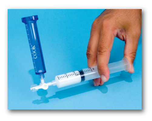
Attach injector barrel to the additional female luer of the standard 3-way stopcock