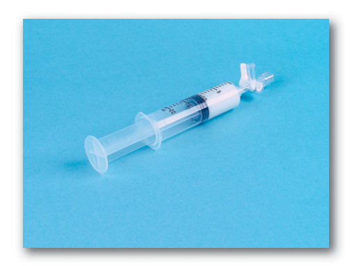
Remove 20 cc syringe from cement mixer with standard 3-way stopcock still attached