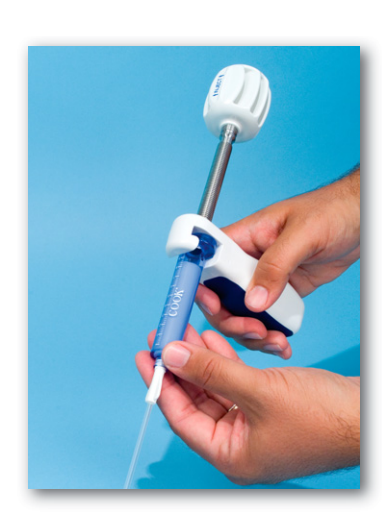
After removing the 20 cc syringe and standard 3-way stopcock from the injector barrel, attach the curved connecting tube