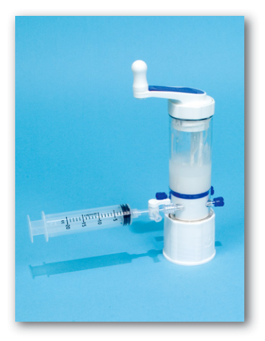
Attach a 20 cc syringe with a standard 3-way stopcock to uncapped port