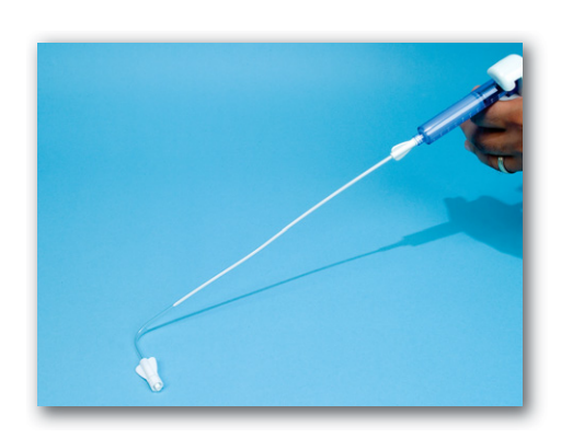
• Turn injector handle to begin cement injection