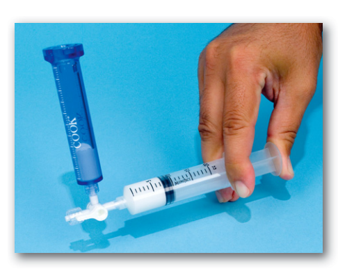
Open the standard 3-way stopcock to the injector barrel