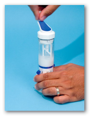
• Mix for 1 minute